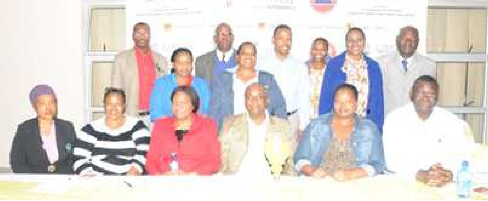
Launched - Members of the recently launched Departmental Gender Forum with members of organised labour and executive management of the department