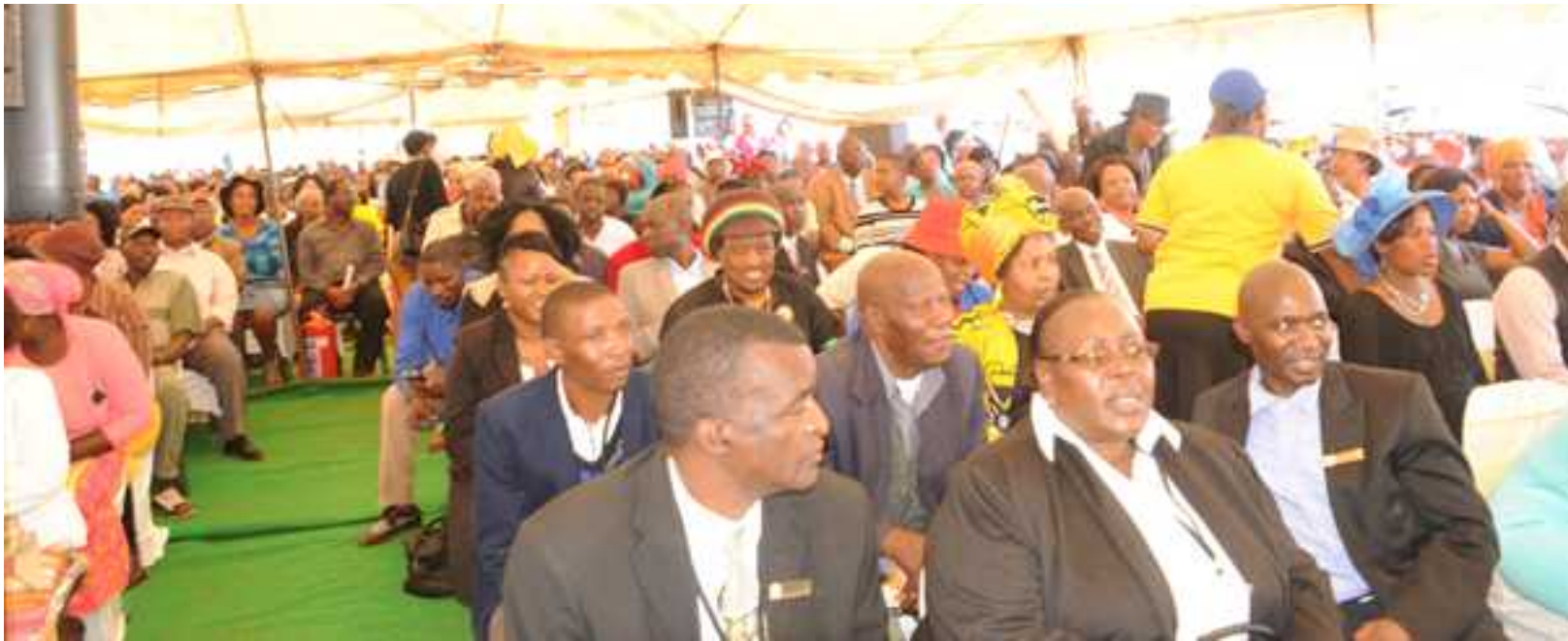
In attendance - Lebowakgomo residents came out in numbers to celebrate with the beneficiaries